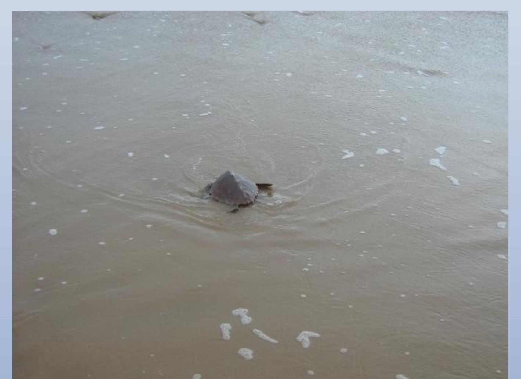
Loggerheads released in the sea near Tanger after rehabilitation

Generally, loggerheads and leatherbacks accidentally captured or stranded on the beaches of Morocco are juveniles or subadults. Moroccan waters provide foraging and development areas and as well as migratory corridors through the Strait of Gibraltar.