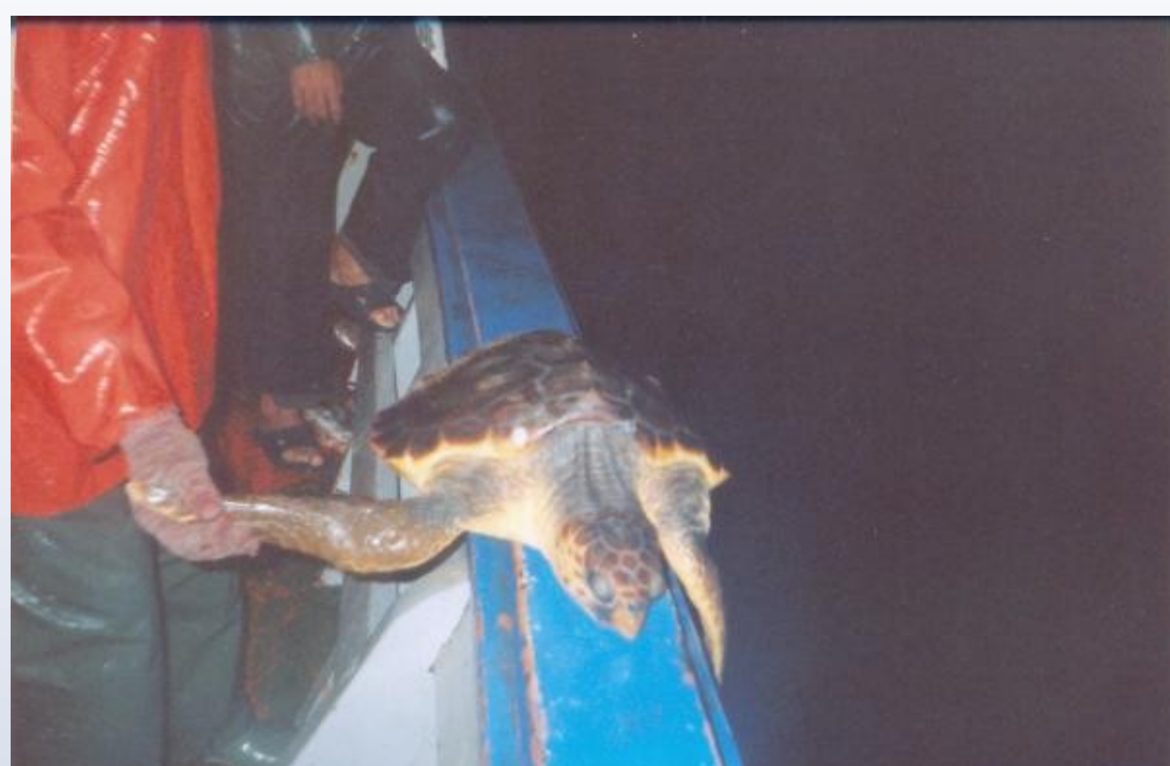
Loggerhead released by a fisherman in the region of Tangier