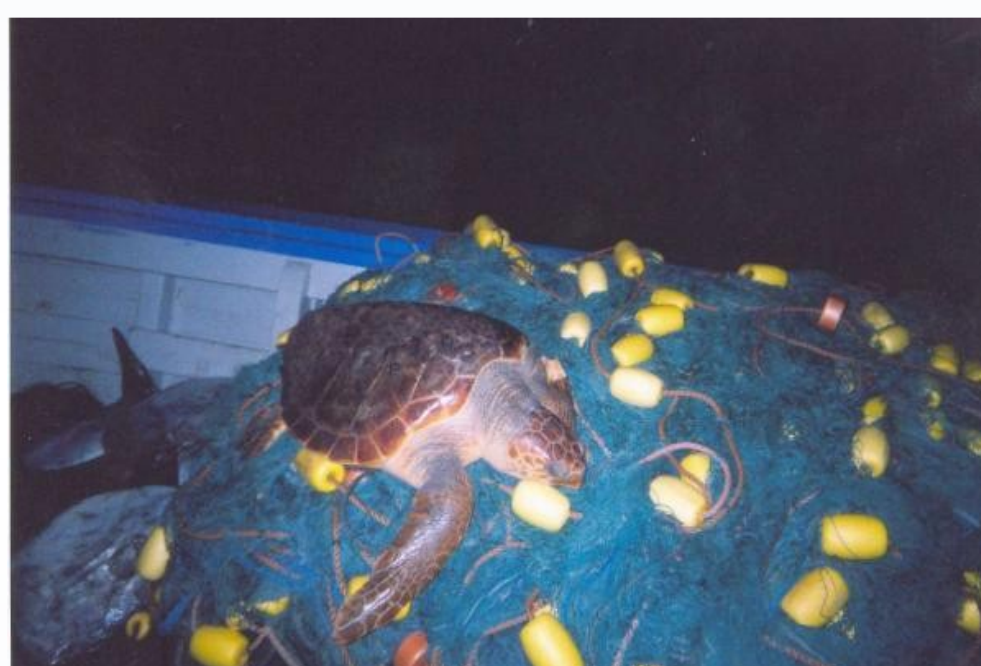
Loggerheads captured accidentally in the west of Tangier