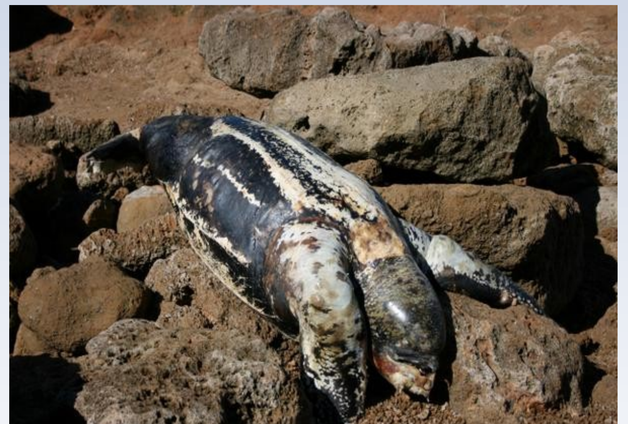
Luth or Dermochelys coriacea stranded on Larache beach