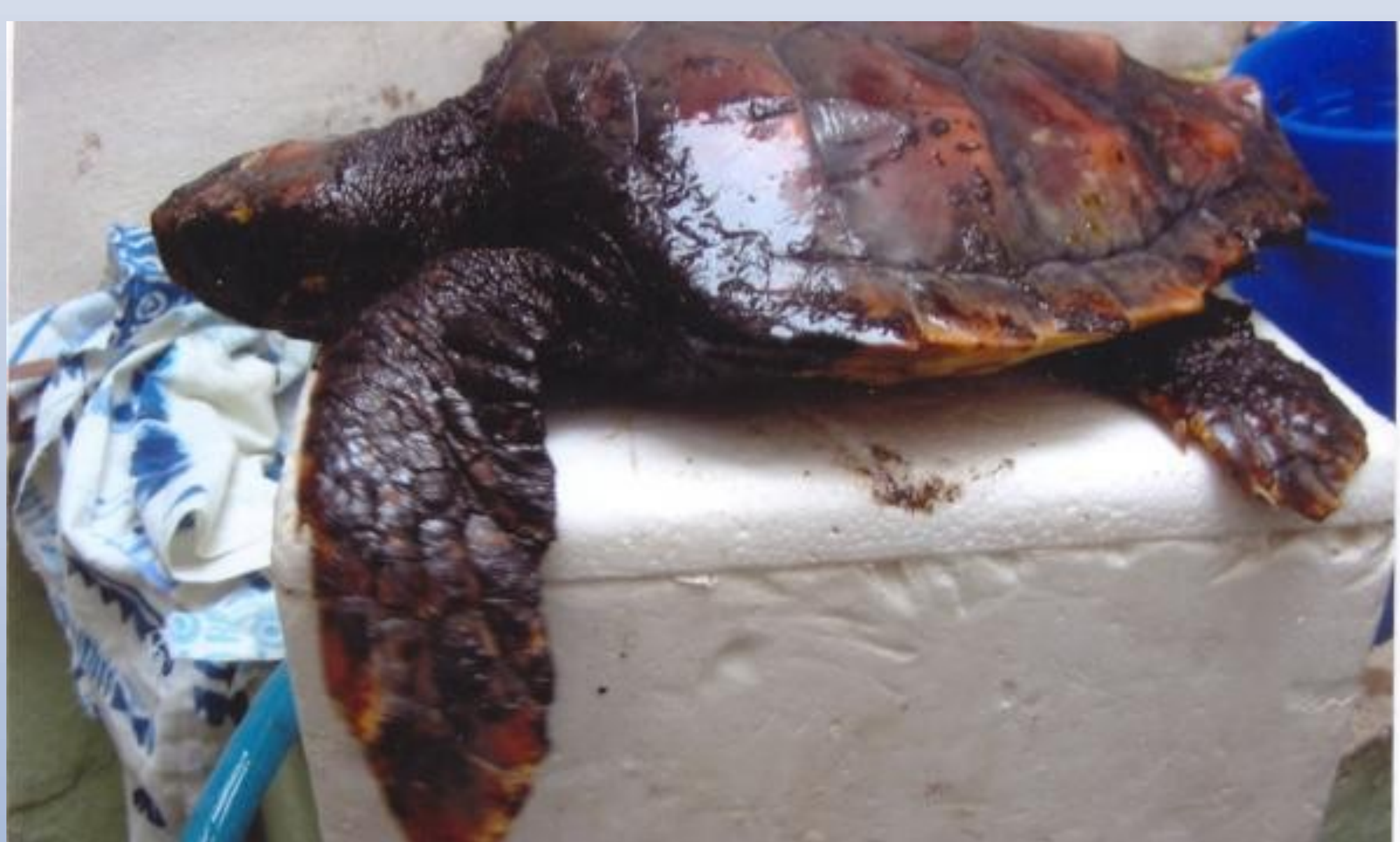
Loggerhead stranded near Tangier because of oil pollution and rehabilitated in the laboratory