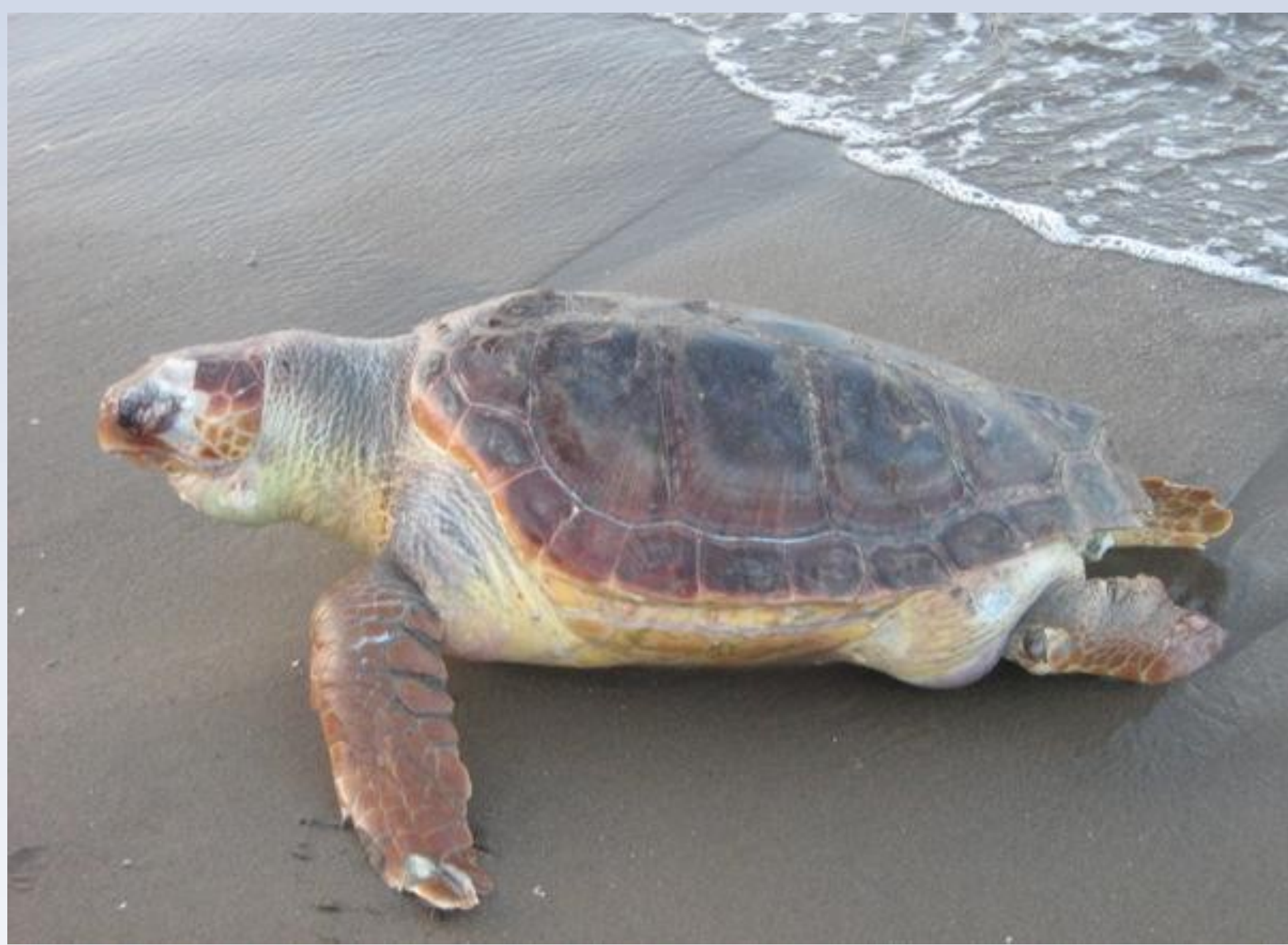
Loggerheads or Caretta caretta stranded in two mediterranean beaches, Azla and Restinga

In Morocco, the two most common sea turtles species are loggerheads and leatherbacks. These turtles are sometimes accidentally captured in fishing gear or found stranded along the Mediterranean and Atlantic coasts of Morocco. Loggerheads represent 95% and leatherbacks 5% of these captured and stranded turtles.